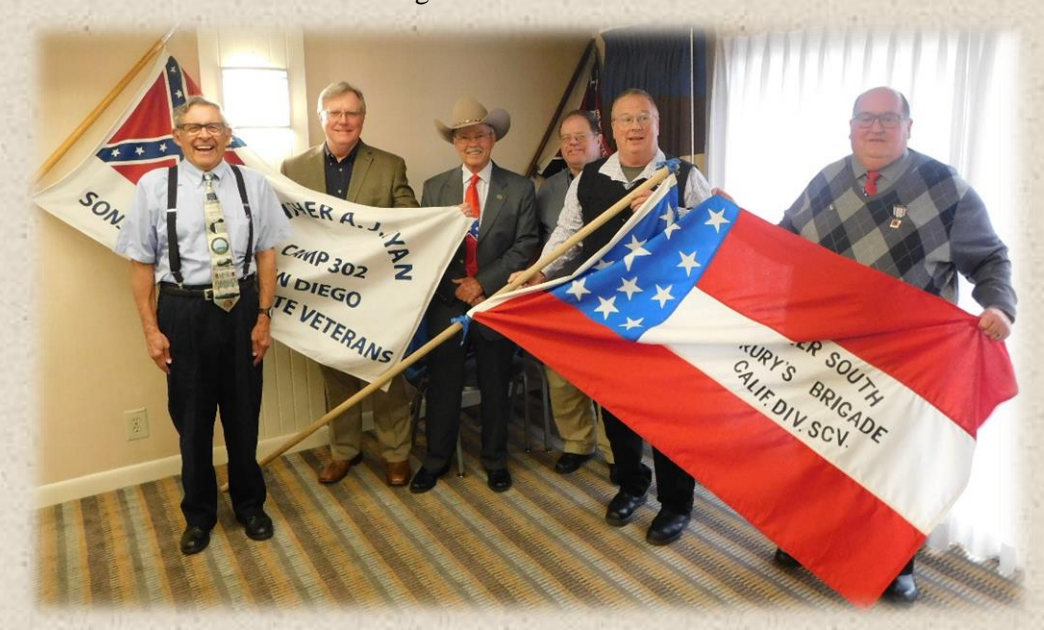
Camp 302 members at left proudly pose with their Camp 302 flag and the division's Lower South Drury's Brigade Flag Saturday afternoon

Seen on this page are a couple of photos of your compatriots taken during the division's stay at the Four Points Hotel during the 2020 Re-Confederation: