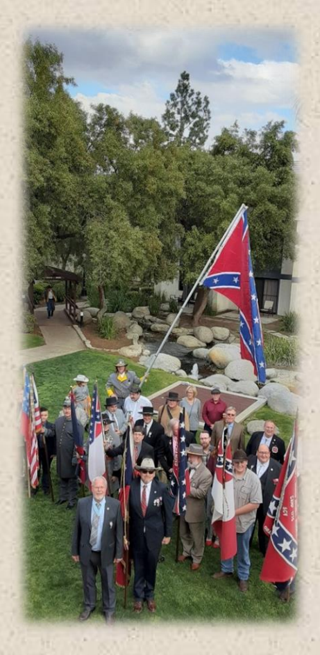
(Continued on Page Seven)

The business meeting concluded with Chaplain Pyle's Benediction, then the break for lunch and, later in the afternoon, the massing of the colors in the hotel courtyard. Following this, Frazier marched the flag bearers into the Bistro Ballroom where division and